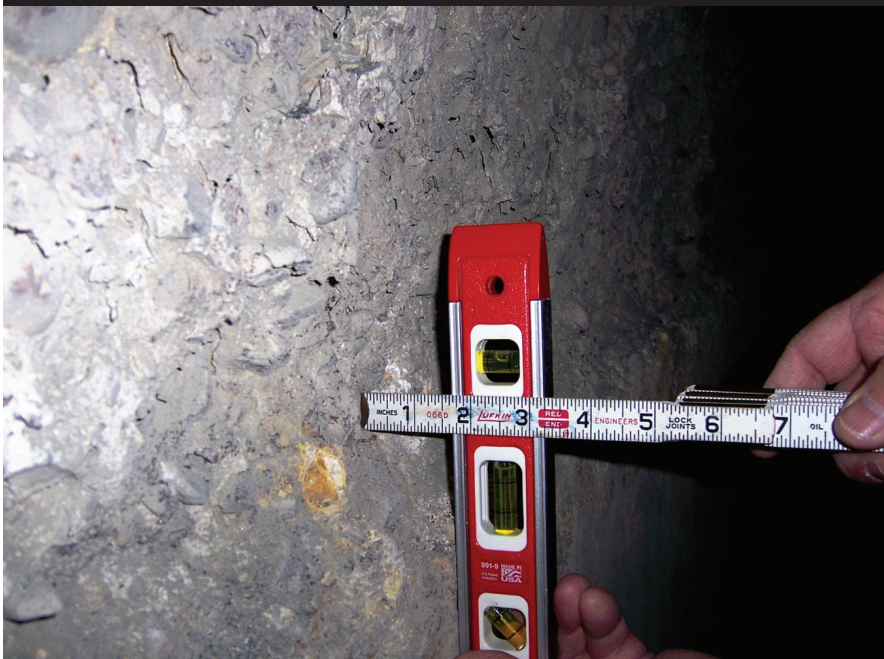
Severe concrete attack from biogenic sulfide corrosion in the headspace of a grit chamber.

mineral name, gypsum. It is usually present in sewers and structures as a pasty white mass on concrete surfaces above the waterline. Another damaging effect