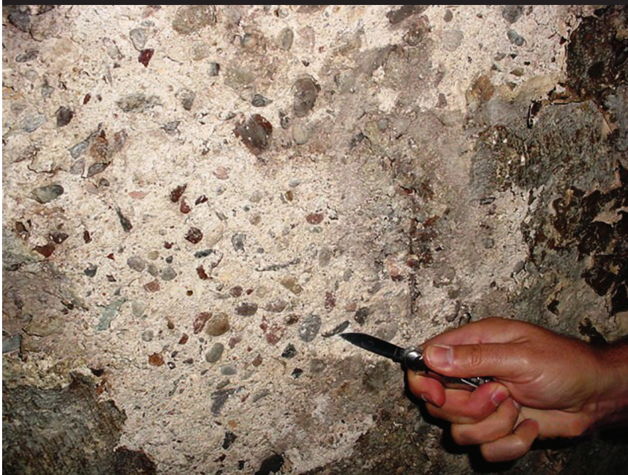
The effects of biogenic sulfide corrosion of concrete, identified by the whitish decomposition products \text{CaSO}_4 and ettringite.