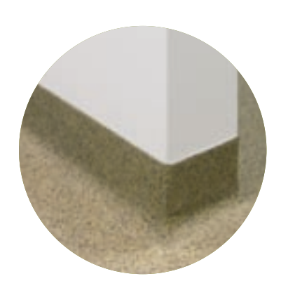
A seamless transition from the floor to the wall can be created by integrating either a cant or rolled radius cove into the existing wall, unlike rubber base materials.

Choose from a range of standard and custom quartz color blends to create a unique floor for your environment. All color blends are available for both broadcast and mortar applications. Series 223 Deco-Trowel will exhibit a different texture and appearance than Series 222 Deco-Tread shown below.