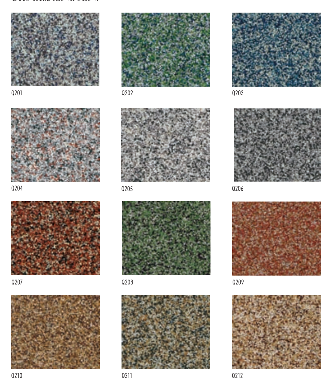
NOTE: Colors shown are representations of actual standards and will vary in appearance due to product, texture variations, gloss level, application method, and thickness of the applied film. Samples are available upon request.