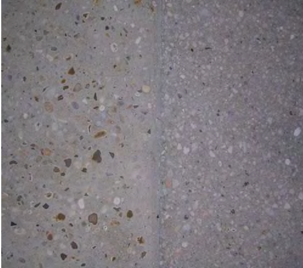
A patched crack.

HIGH PERFORMANCE COATINGS | POLISHED CONCRETE | CHEMICAL DENSIFICATION