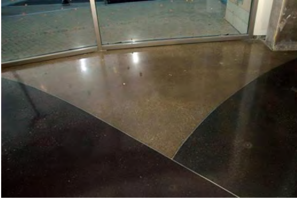
Recycled Glass Mixed with Black Cement

HIGH PERFORMANCE COATINGS | POLISHED CONCRETE | CHEMICAL DENSIFICATION